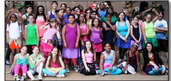
The cast of Dream On!, Hope Academy of Music and the Arts' 2011 Showcase Performance, based on "A Midsummer Night's Dream."

More classically-inclined musicians—of all ages and abilities—are invited to participate in EL CEO (East Liberty Community Engagement Orchestra). Find out more and be evaluated for your music level in this free community orchestra on Sat., Sept. 10.