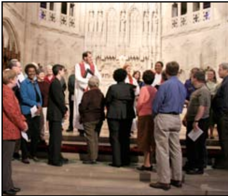
ELPC's new elders and deacons gather in the chancel following their ordination.