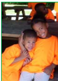
Youth enjoy the day at Squaw Valley Park during VCS 2009.

Note: ELPC is pleased to offer VCS to families free of charge. To help cover our program's costs, we are seeking donations from our ELPC family to purchase supplies and snacks. If you can help, please take a tag from the bulletin board at the bottom of the main stairwell and purchase the items listed on the tag. Donations are due back no later than Sun., June 20 .