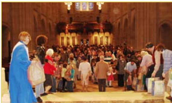
The congregation brings forward Thanksgiving Bags on Stewardship Sunday 2008.

Prayerfully consider taking a bag, and returning it on Sun., Nov. 8. During the 11 am service, we'll bring these bags forward as a special offering, and dedicate them to God's use. They'll be donated to the EECM Food Pantry and given to needy families in the East End.