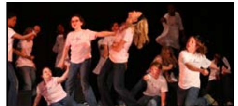
Shakespeare/Stage Combat Workshop, beginning in January, will help young actors explore Shakespeare's plays through voice, movement, acting and theater games in order to prepare for the Pittsburgh Public Theater's Shakespeare Monologue and Scene Contest in March.