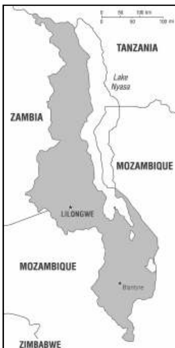
Map of Malawi

Is God calling you to the "warm heart of Africa"? (Malawi). The Pittsburgh Presbytery 2007 trip to Malawi will take place on June 14–29, 2007. Trip details and application forms are now available by