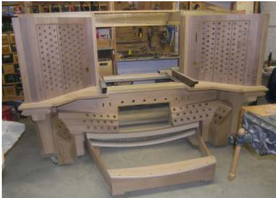
ELPC pipe organ restoration project's Jan 10, 2007 pic-o-the-day. The toe stud rail mounted in the console. It's starting to look like a cockpit for sure!