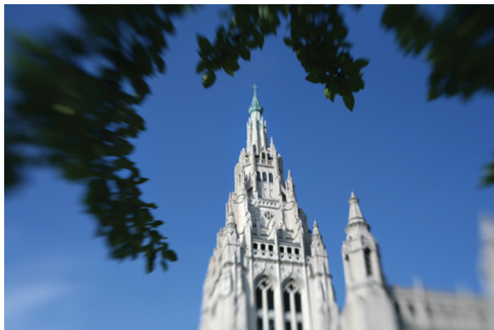
Salvation: The spire of East Liberty Presbyterian Church

Geographically and otherwise, East Liberty straddles the border between wealthier communities like Shadyside and more troubled neighborhoods like Homewood. And for good and bad, the area has been the poster child for urban renewal in Pittsburgh.