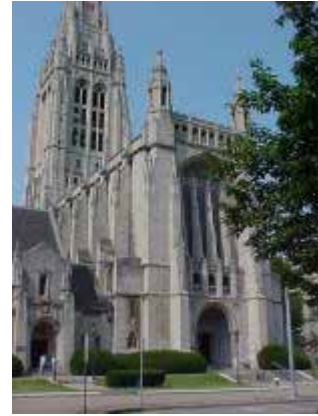
ELPC from Penn Avenue

Like many of the most famous cathedrals of Europe, the East Liberty Presbyterian Church is built in the Gothic style which emerged in the twelfth century, largely under the influence of the Cistercian Order and the remarkable Abbot Suger of St. Denis, Paris. It is characterized by the use of ogival (pointed) arches and by the emphasis on light mediated through magnificently colored stained glass. It is the first type of Christian architecture which seeks to express in virtually every detail the essence of the Biblical faith, hence its cruciform floor plan. Form and function are perfectly combined in every detail to a degree rarely, if ever, realized in other types of Christian architecture. Visitors who study the symbols on the exterior of the building have no difficulty in identifying this church as being in the Reformed tradition. The interior art proclaims its inescapable ecumenicity as a living part of the Holy Catholic (universal) Church.