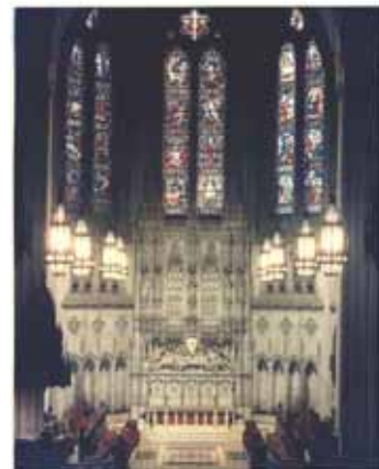
The Sanctuary Chancel

You might like to spend a moment examining the central panel of the last of the Psalm windows to see if you can detect an error made by the stained glass craftsman.